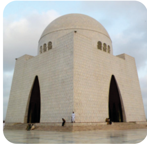
The Tomb of Quaid-e-Azam (رحمة الله عليه)

In 1940, the Pakistan Resolution was passed under his leadership in which a separate homeland for the Muslims was demanded. On 14 th August, 1947 Pakistan came into existence with his untiring efforts. He became the first Governor General of Pakistan. He died on September 11, 1948. His tomb is in Karachi. He is also known as the Father of the Nation.